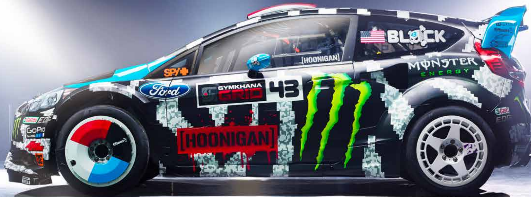
The Ford Fiesta ST RX43 in Gymkhana setup, featuring fifteen52 Turbomac wheels with Turbofans mounted to the front wheels.