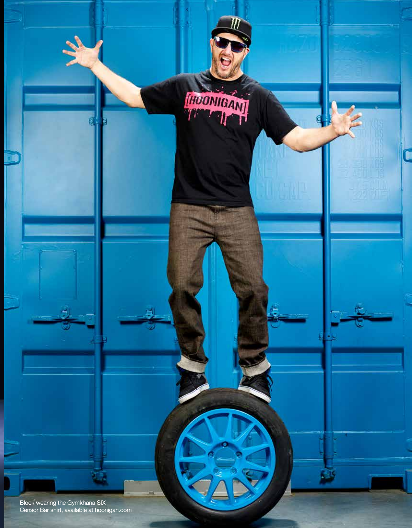
Block wearing the Gymkhana SIX Tensor Bar shirt, available at hoonigan.com