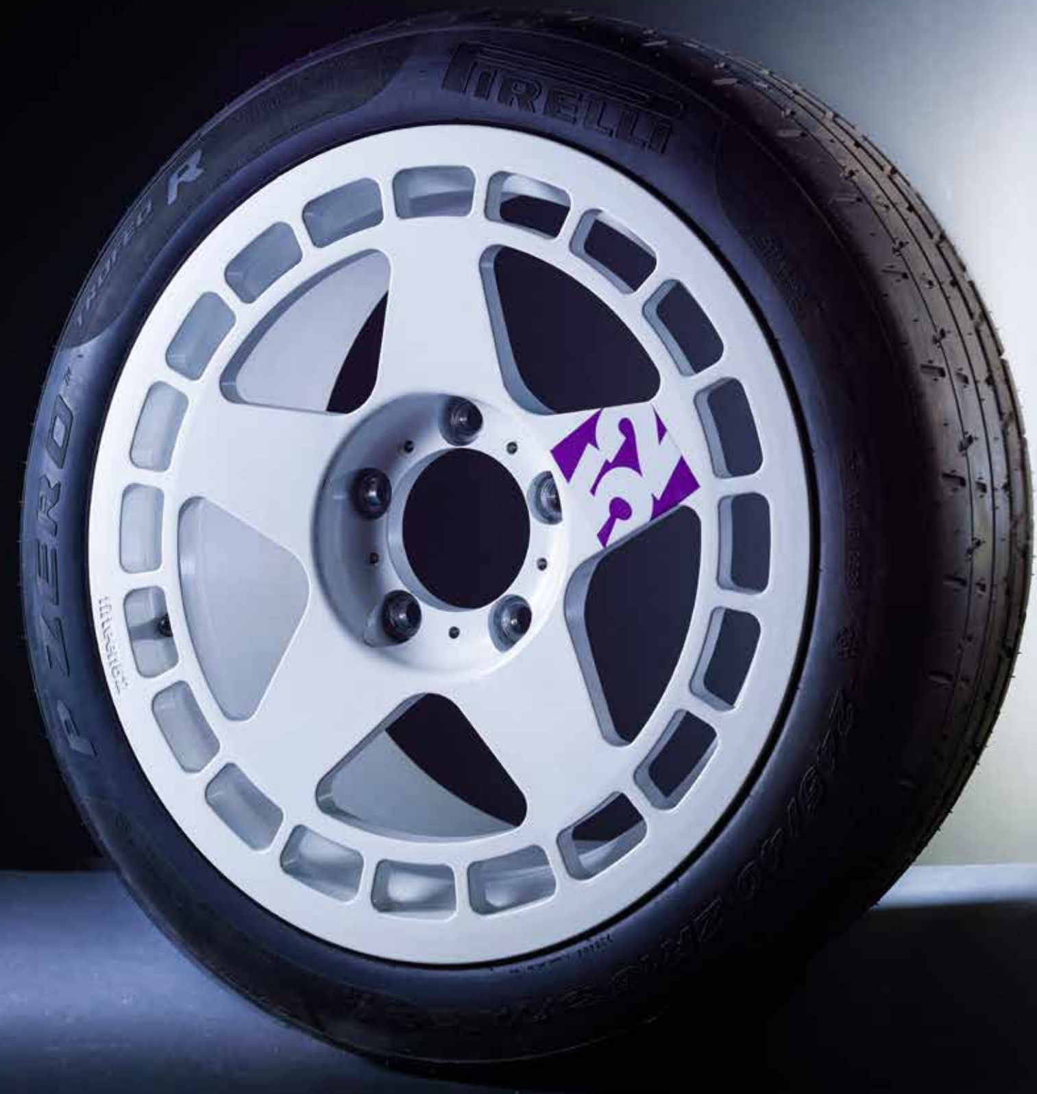
The fifteen52 Turbomac was co-designed by Block.