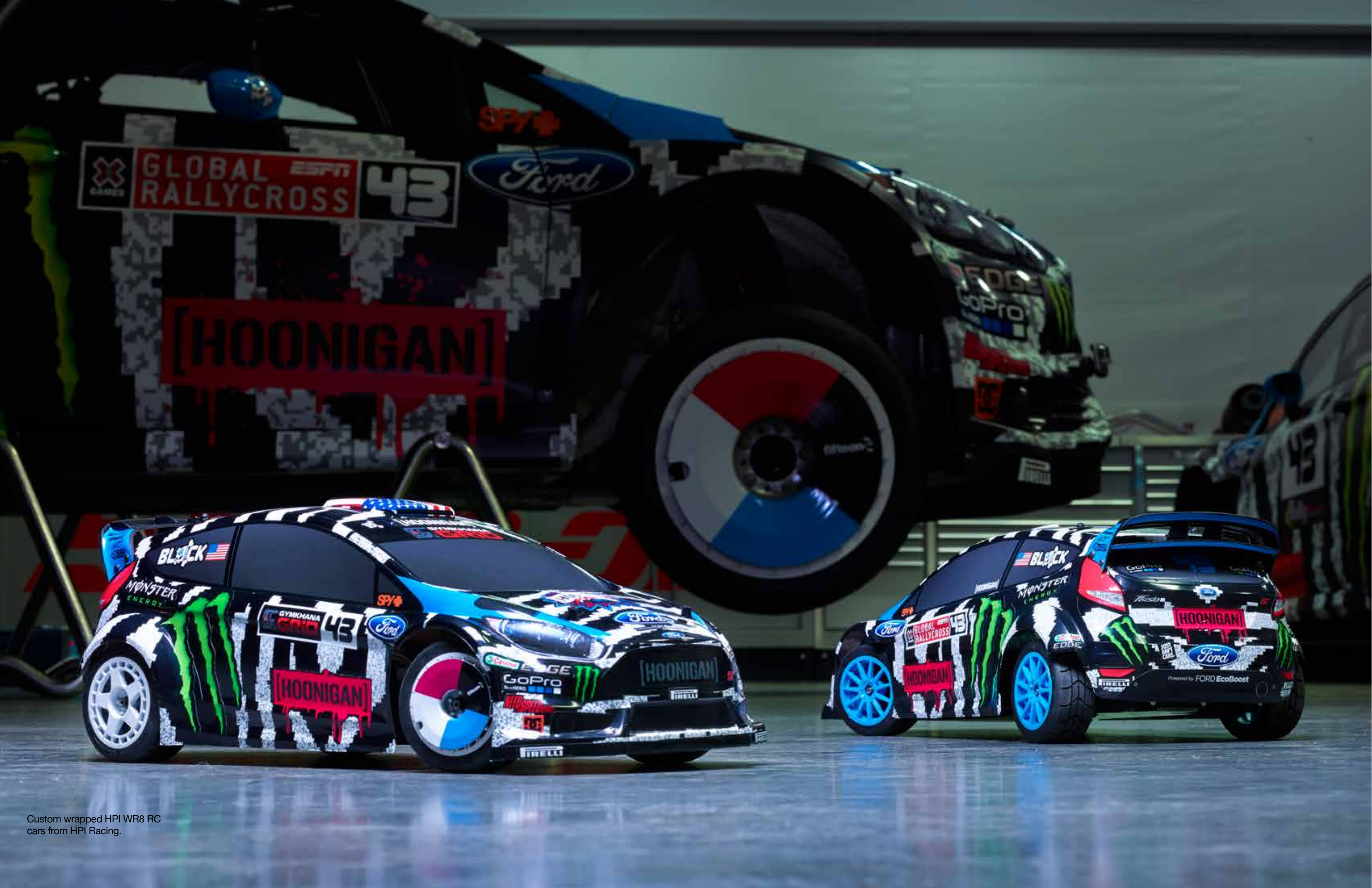
Custom wrapped HPI WR8 RC cars from HPI Racing.