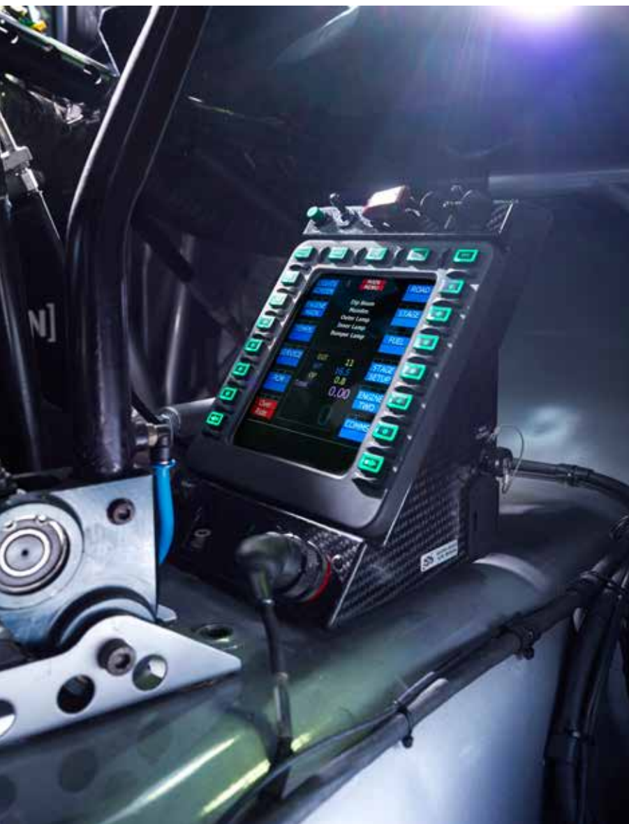
The RX43 engine management system by Cosworth/M-Sport.