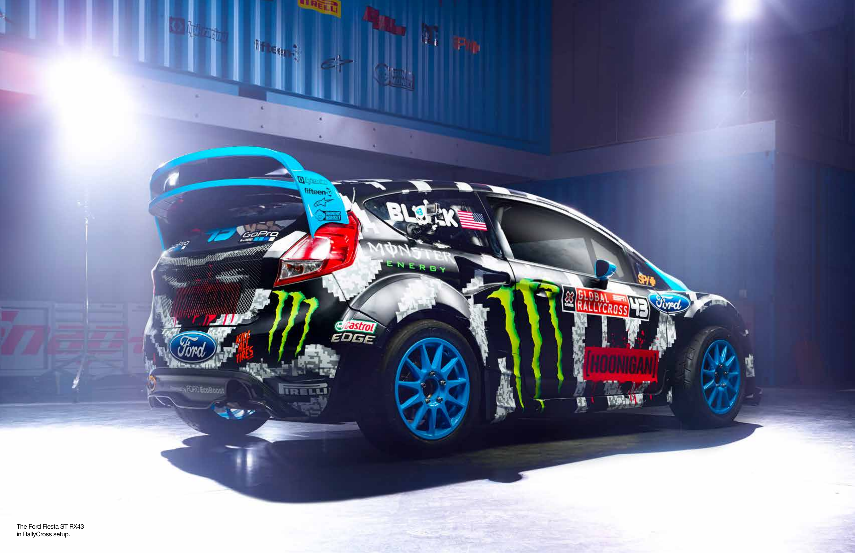
The Ford Fiesta ST RX43 in RallyCross setup.