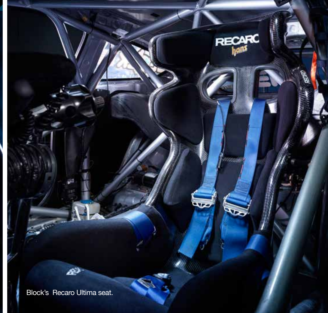
Block's Recaro Ultima seat.