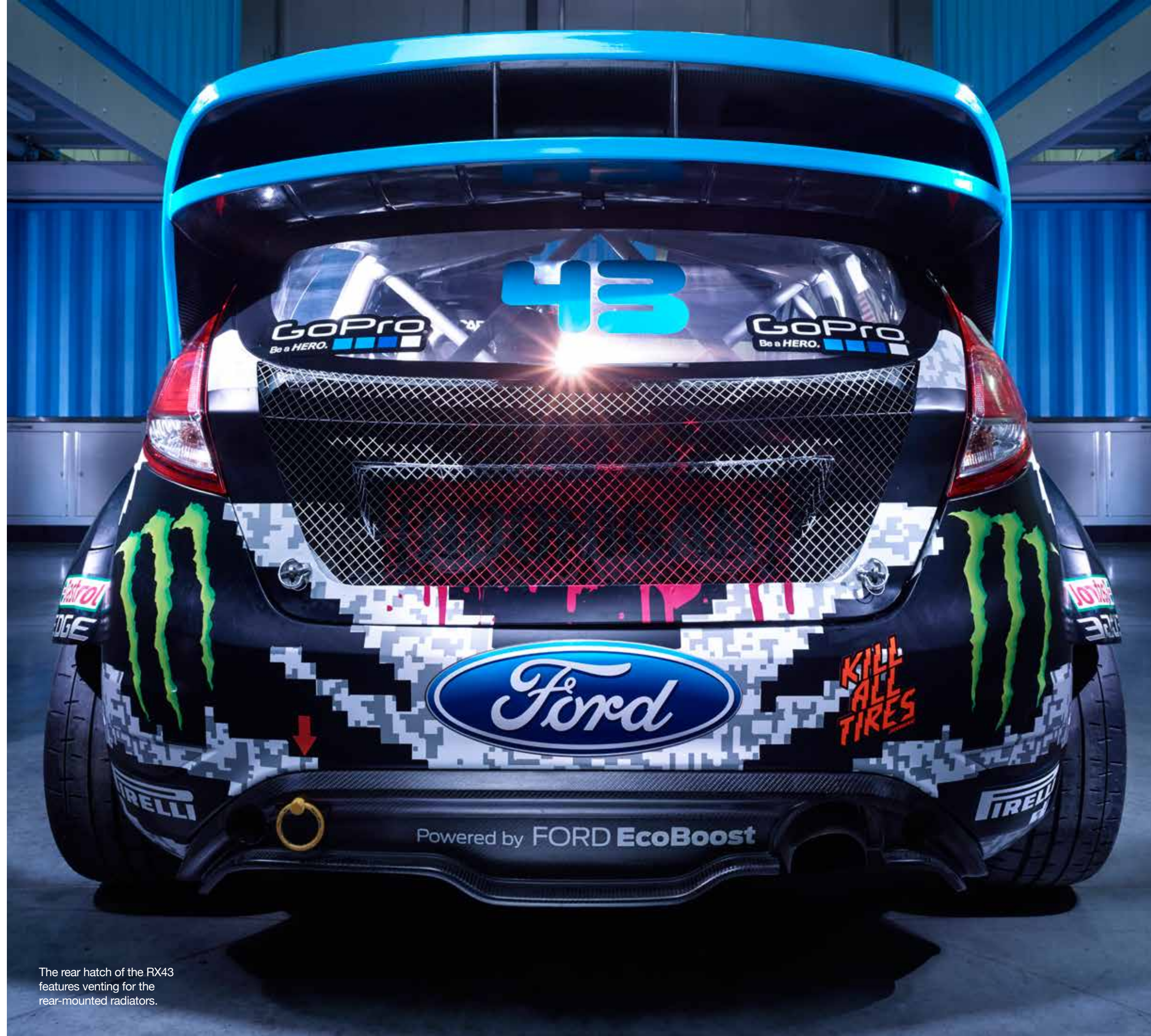
The rear hatch of the RX43 features venting for the rear-mounted radiators.