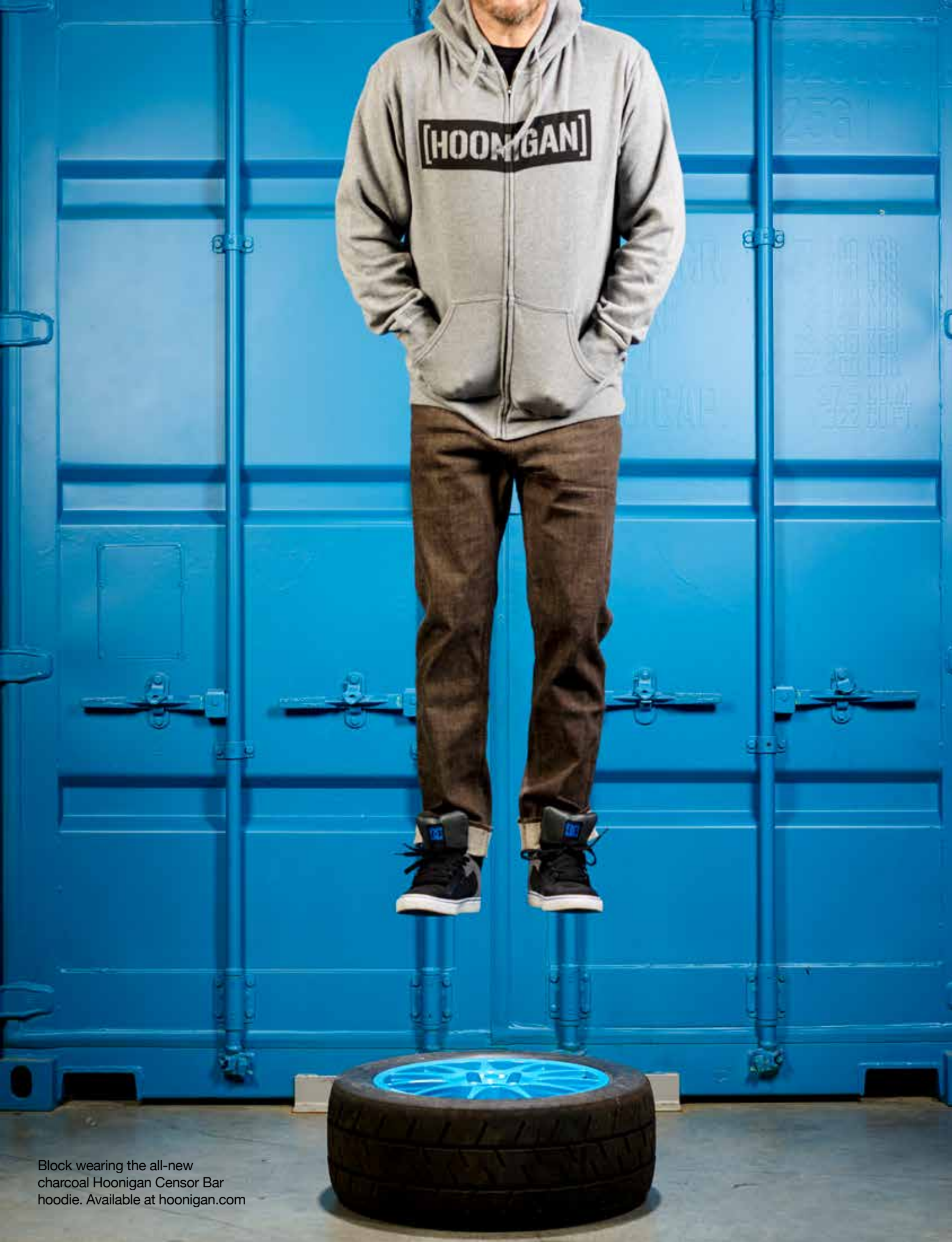
Block wearing the all-new charcoal Hoonigan Sensor Bar hoodie. Available at hoonigan.com