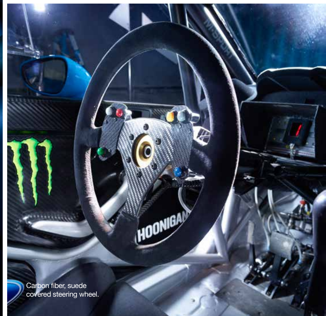
Carbon fiber, suede covered steering wheel.