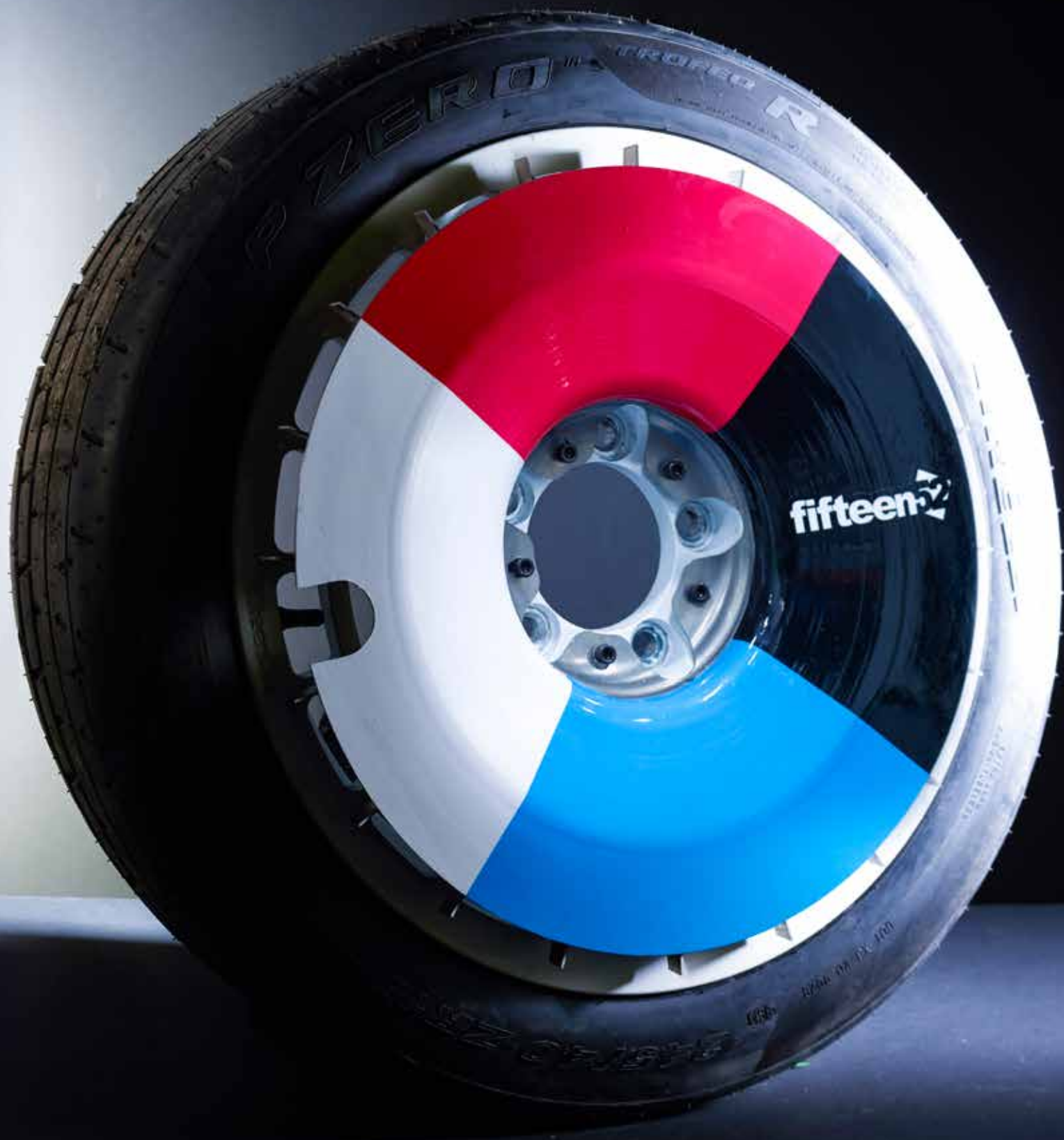
A fifteen52 Turbomac wheel with Turbofan mounted, wrapped in Pirelli rubber.