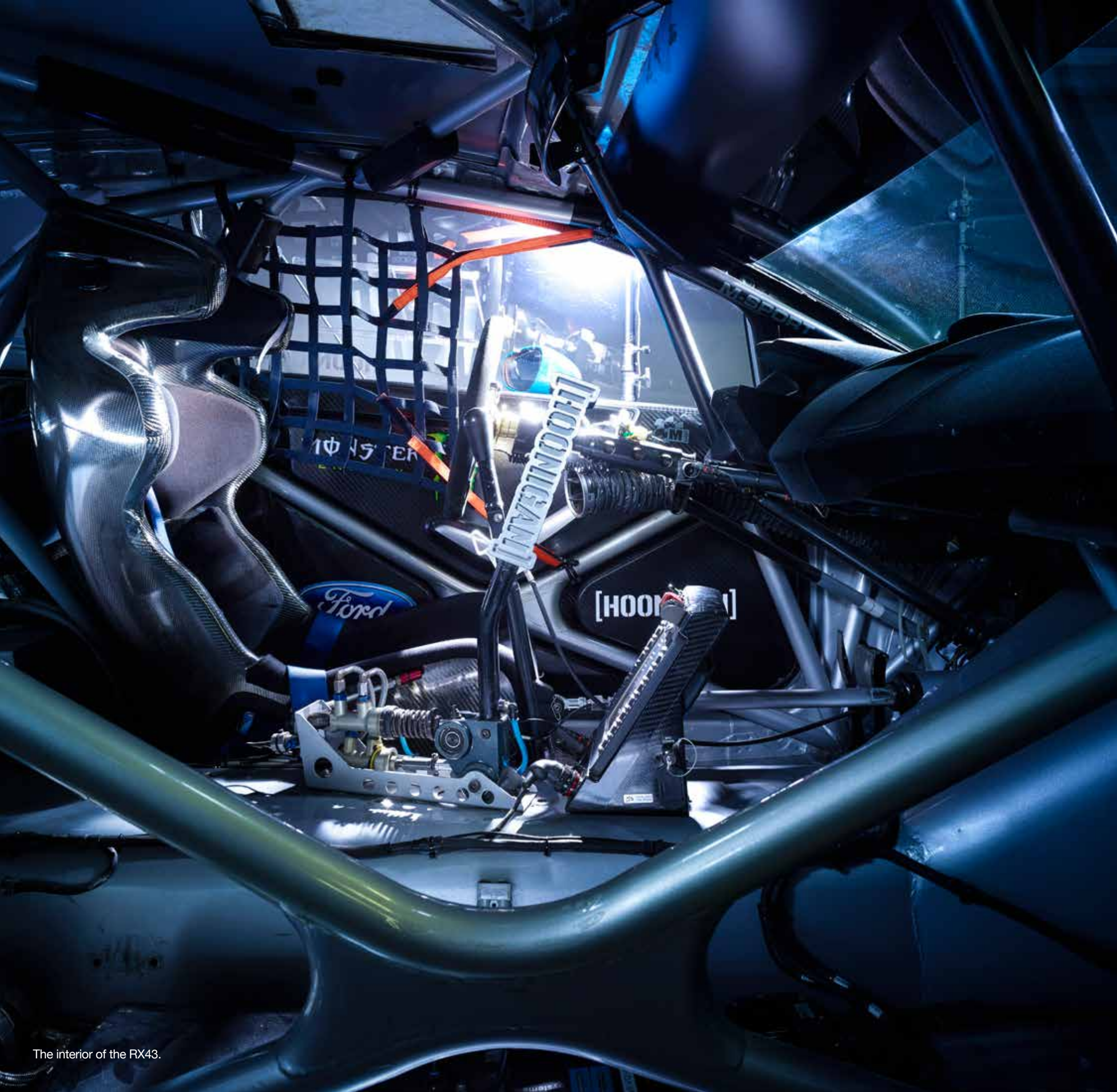
The interior of the RX43.